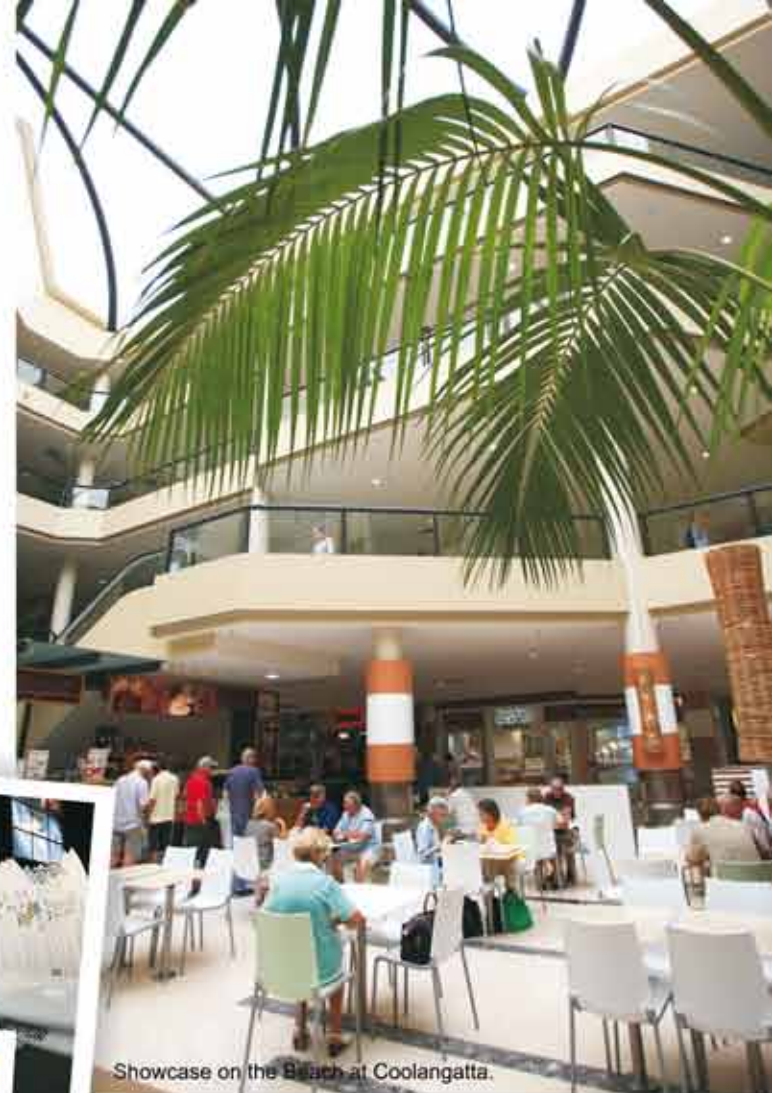
Showcase on the Beach at Coolangatta.

🛍 After breakfast, browse through Kirra's boutique fashion and homeware stores and visit Kirra Surf, the largest surf store in the Southern Hemisphere.