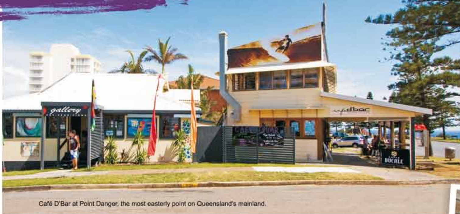
Café D'Bar at Point Danger, the most easterly point on Queensland's mainland.

🛍 Everything you need is right here in Coolangatta! Supermarkets and convenience stores, the air-conditioned Showcase on the Beach shopping mall, designer boutiques and surf shops, beauty and hair salons, specialty stores laden with elegant homewares, gifts and souvenirs, and stunning photography, arts and crafts.